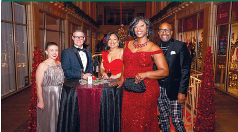
The inaugural Big Red Ball offered bold looks, big energy and a shared mission raising $40,000.