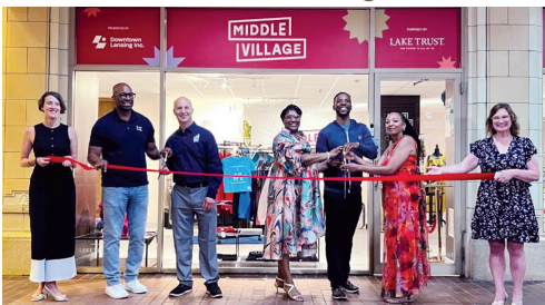
Middle Village, a 12-month retail accelerator program, welcomed its fifth cohort