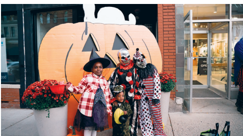
Events like Trick-or-Treat on the Square helped welcome over one million visitors this year to the heart of the Capital City.

“This year, Downtown Lansing has shown what’s possible when shared vision meets collective action. With over $628 million in investment and development coming to Michigan’s Downtown, we’re witnessing the true power of partnership and perseverance. From transformative projects and creative collaborations, Downtown Lansing is growing stronger every day. Let’s keep building Michigan’s Downtown—together.”