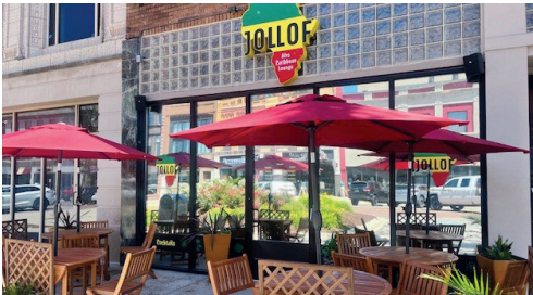
New businesses, such as Jollof Afro-Caribbean Cuisine, are diversifying the dining and shopping options you can experience on weekends and into the evening hours.